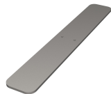
Flat Base 400mm X 100mm X 5mm